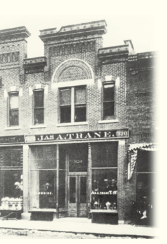
Trane Storefront La Crosse, Wisconsin 1891

conditions. When you buy a Trane, you're buying a commitment from us, to you. A commitment to your total comfort, and your total peace of mind. Because that's what Reuben and James would have done.